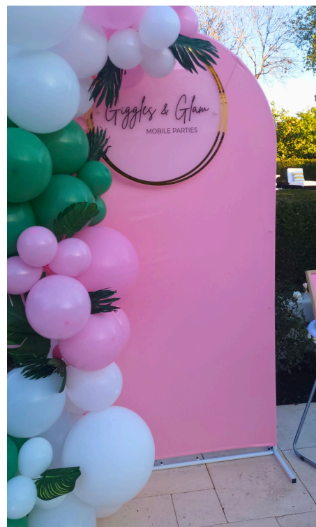
BALLOON ARCH WITH DECOR ADD-INS

Add in banana leaves, florals, etc. for a unique touch!