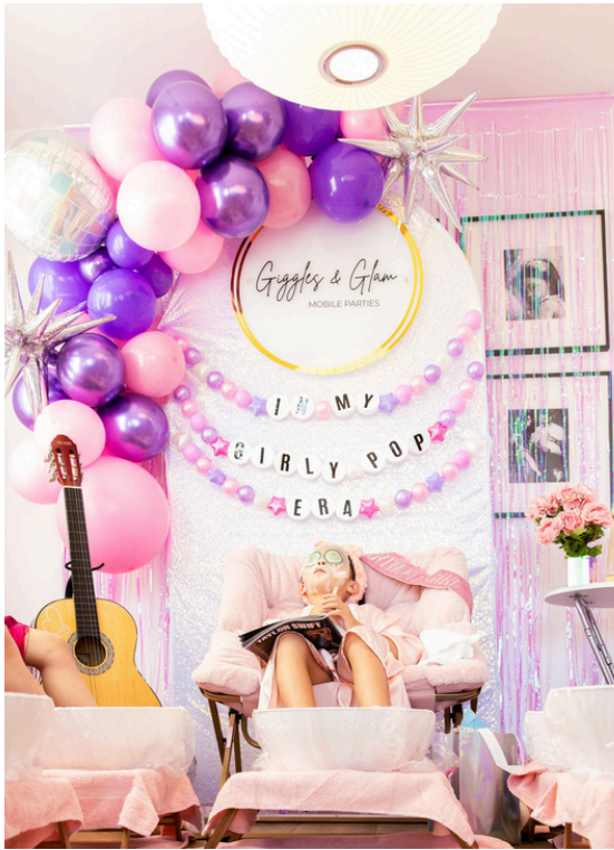
CORNER GARLAND (6FT)

**$10 per foot of balloons, pricing for add-in decor available as a customization