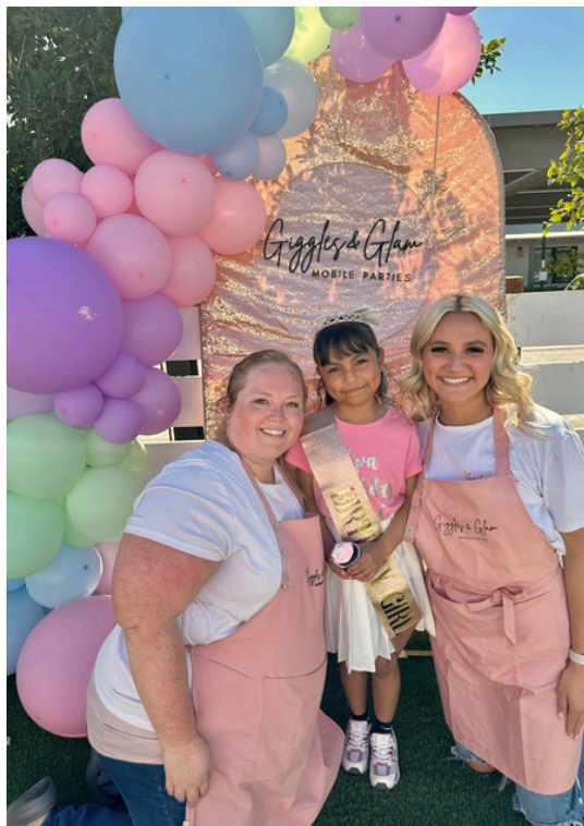
WIDE BASE FLOOR TO TOP OF ARCH (12FT)