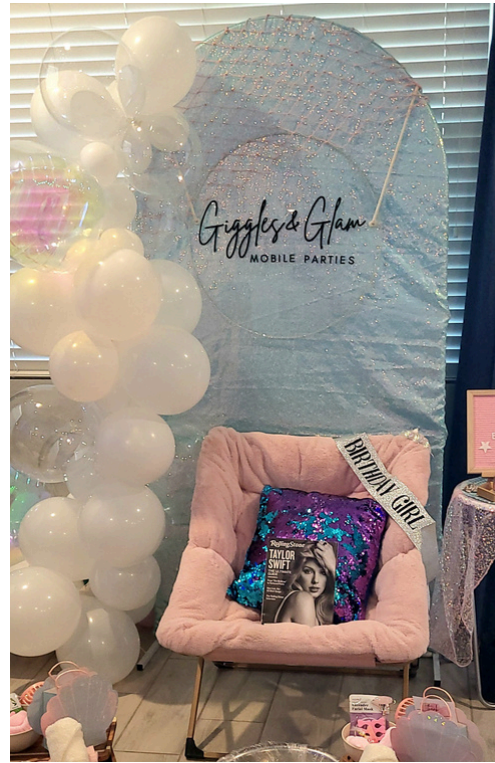
FLOOR TO TOP OF ARCH (10FT)